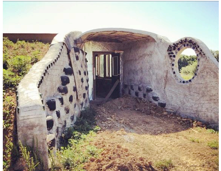
Sustainable Earthship made of old tires and mud

homes. For further information please see the attached information sheet.